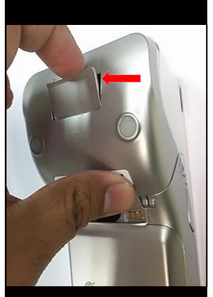
1. Place your finger under the paper lid release level and pull the entire lid.