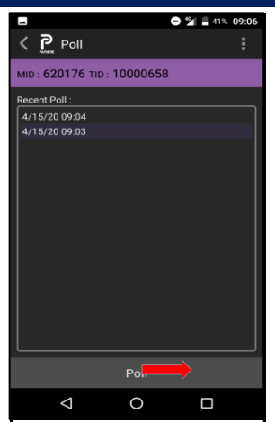
2. To perform polling, tap <Poll> to continue.