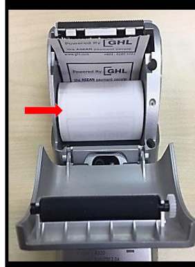
2. Drop in the paper roll with the paper pulling from the back and out the top of the roll.