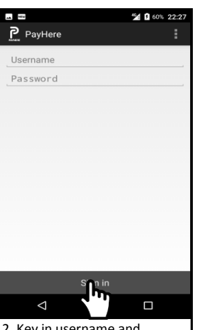
2. Key in username and password, then tap <Sign in>. (*no sign in require if never logout)