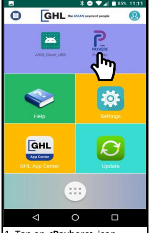
1. Tap on <Payhere> icon