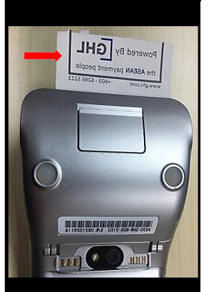
3. It is important the lid is fully closed so that the paper roll fully engages the paper.