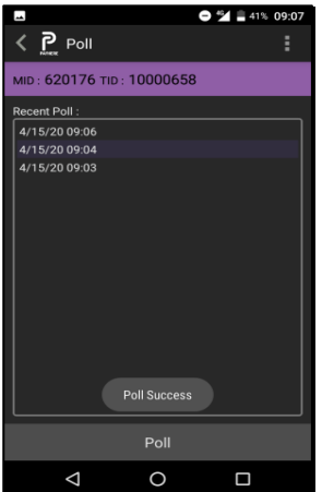
4. Poll Success.