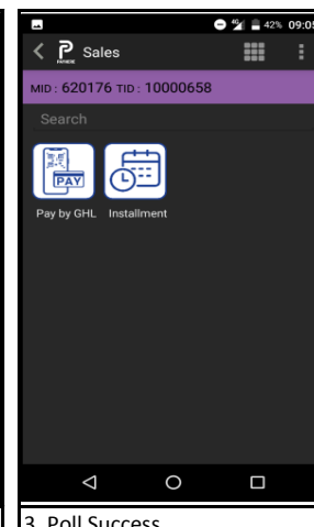
3. Poll Success